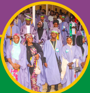
Abstain from Extremism, Immoral Acts – UDUS VC advises Matriculating Students