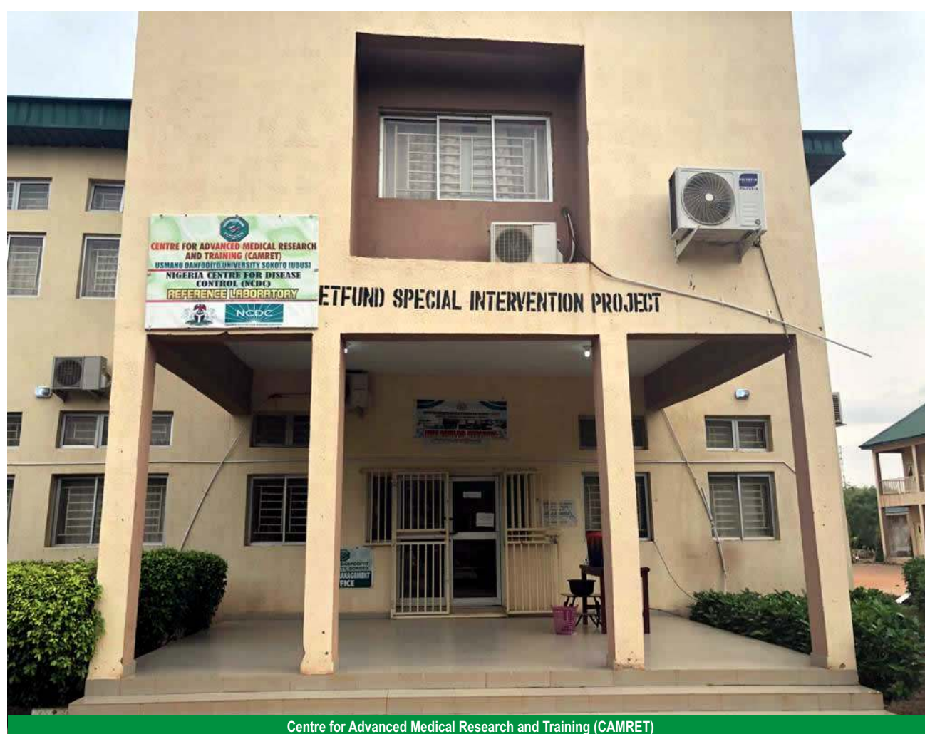
Centre for Advanced Medical Research and Training (CAMRET)