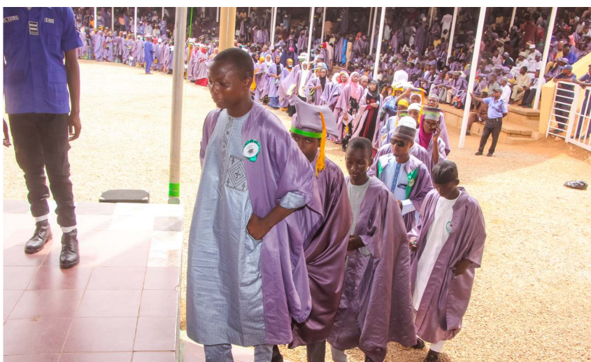
Matriculating students making their way to the dais for the oath taking

The degrees of the Usman Danfodiyo University are only awarded to deserving students who are found to be worthy in character and learning