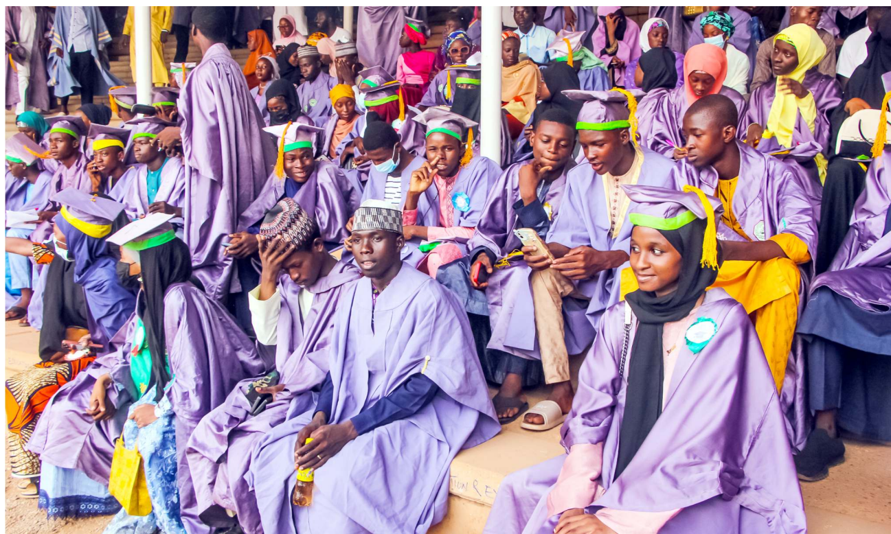
Cross section of the matriculating students