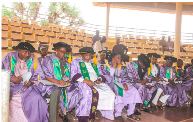
Deans of Faculties seated in the Dais