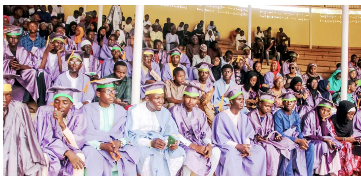
Cross section of the matriculating students