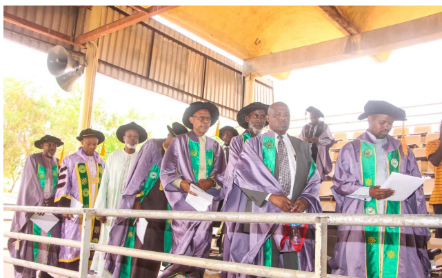
Deans of Faculties in Procession