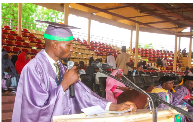
Chairman, Students Union Caretaker Committee making his remarks