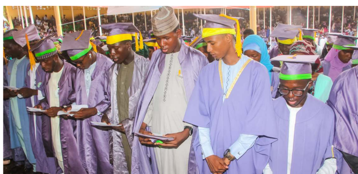
The Matriculating students taking their oath