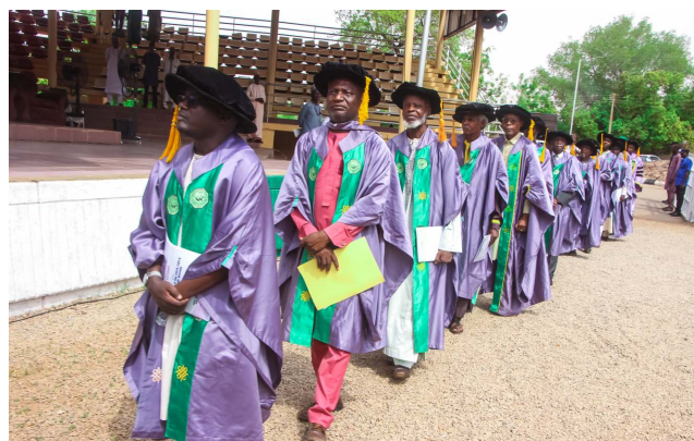
Senate Members in Procession