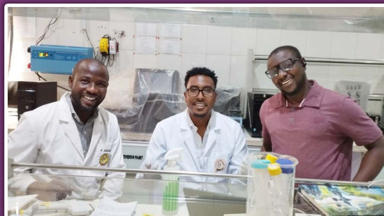
Chala with CAMRET researchers during ELISA detection of IL-6 protein

#CAMRET #UDUS #ScientificCollaboration #COVID19Research #AfricanScience