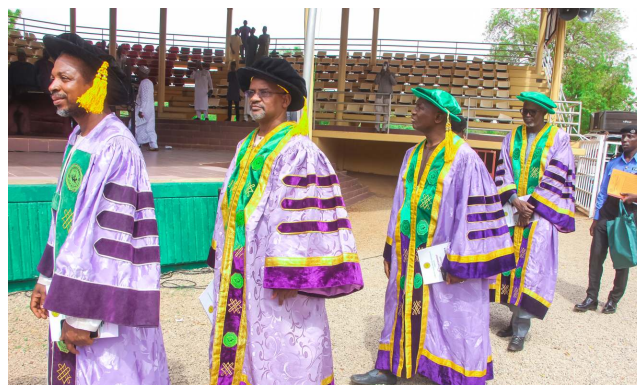
Some Principal Officers in Procession: DVC (RI&D), DVC (Administration), DVC (Academic), and Vice Chancellor