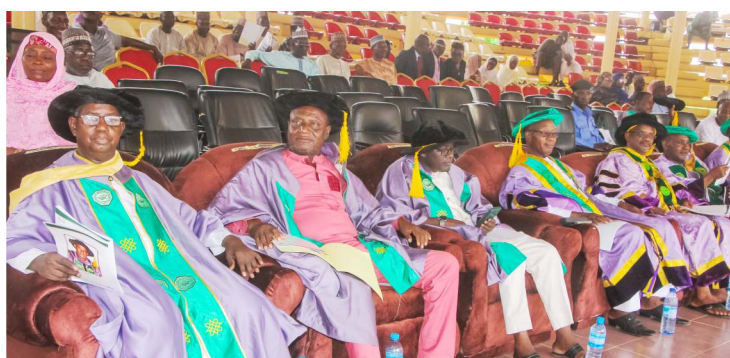
Chairman and some of the members of Ceremonies Committee at the Matriculation Ceremony