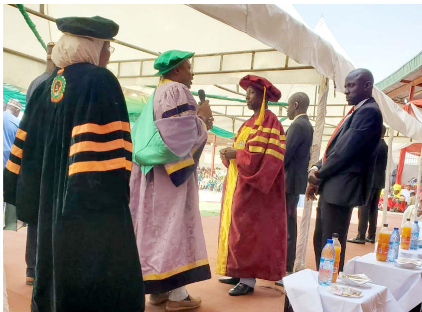
The DVC (RI&D) presenting goodwill message on behalf of Usmanu Danfodiyo University, Sokoto at the convocation of Federal University, Gusau