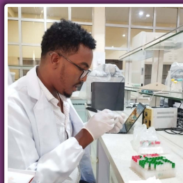
Chala preparing of samples for PCR amplification on the extracted DNA/RNA