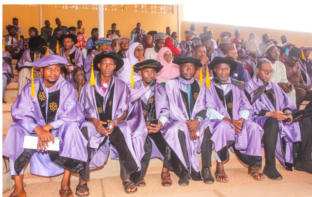
Cross-section of the Matriculating students