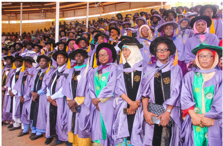
A cross section of graduands during the convocation ceremony