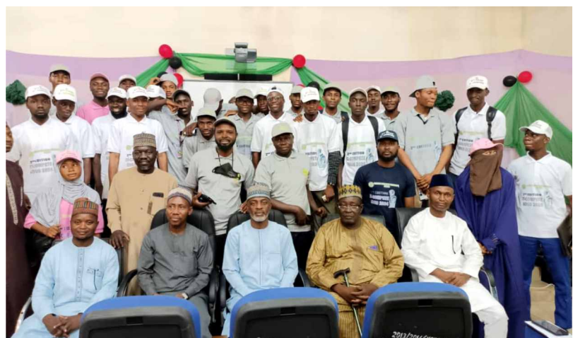
A cross-section of participants, officials, and invited guests at the 2nd UDUS IT-Compete grand finale