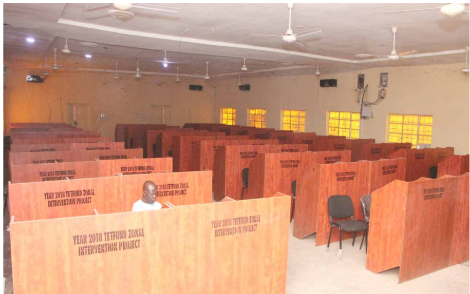
Renovation and Furnishing of ETF Examination Hall for Computer Base Test (CBT) Centre