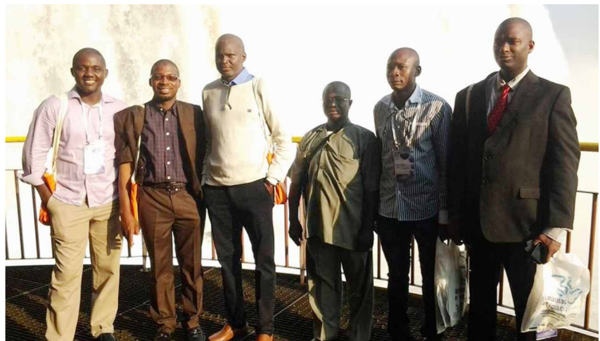
A group photograph of the Best Antioxidant Research Group

The Team has attracted research grants from organizations such as the Nestle Foundation, Lausanne, Switzerland, International Foundation for Science, Stockholm Sweden, Raw Materials Research and Development Council, Abuja, and Tertiary Education Trust Fund, Abuja. The Team has three patents and several publications to its credit.