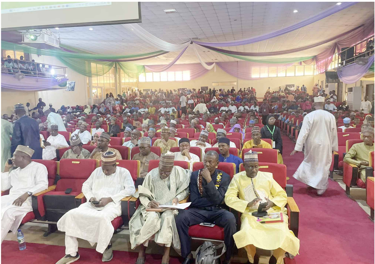
A cross section of dignitaries during the Convocation Lecture

"This sort of approach is a core focus of the Renewed Hope Agenda. Its initiatives include infrastructural development, job creation, education and healthcare provision as well as efforts to tackle poverty and inequality," he said.