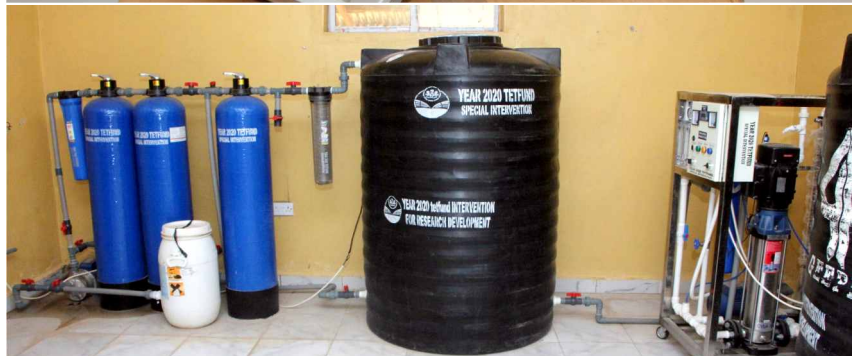
Some of the facilities at Urology and Nephrology Centre