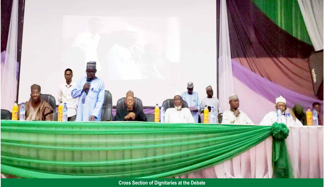
Cross Section of Dignitaries at the Debate

The 2024 joint convocation of the Usmanu Danfodiyo University, Sokoto among other things featured students activities among the lined up of convocation activities. However, three major activities; Convocation Debate, Convocation Drama and Convocation Novelty Foot Ball Martch were all partaken by the students of the Usmanu Danfodiyo University, Sokoto.