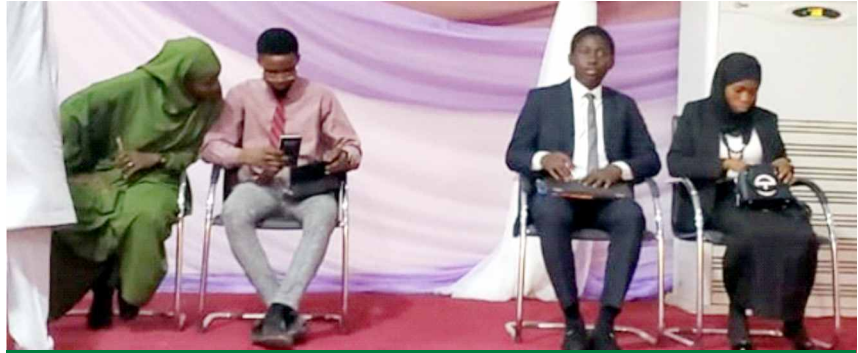
The two teams: Proposing to the right while opposing to the left