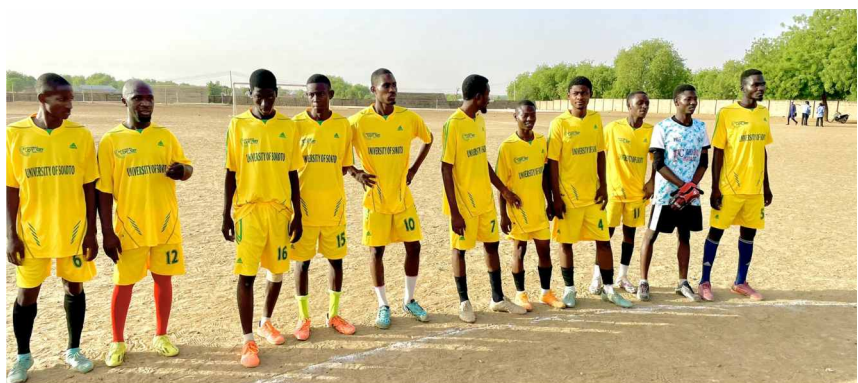
A cross section of the Students' Team