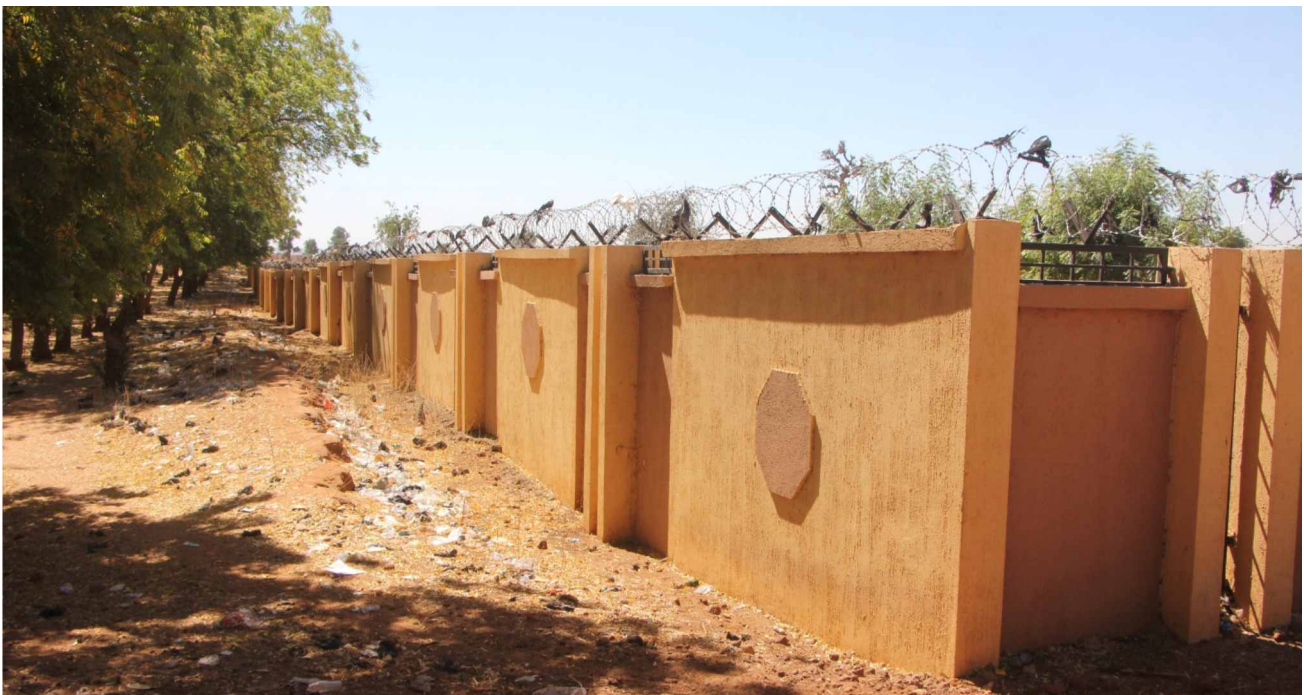
A section of the completed University perimeter fence

Bilbis appealed for the completion of the University's perimeter fencing and the relocation of villages inside the University area.