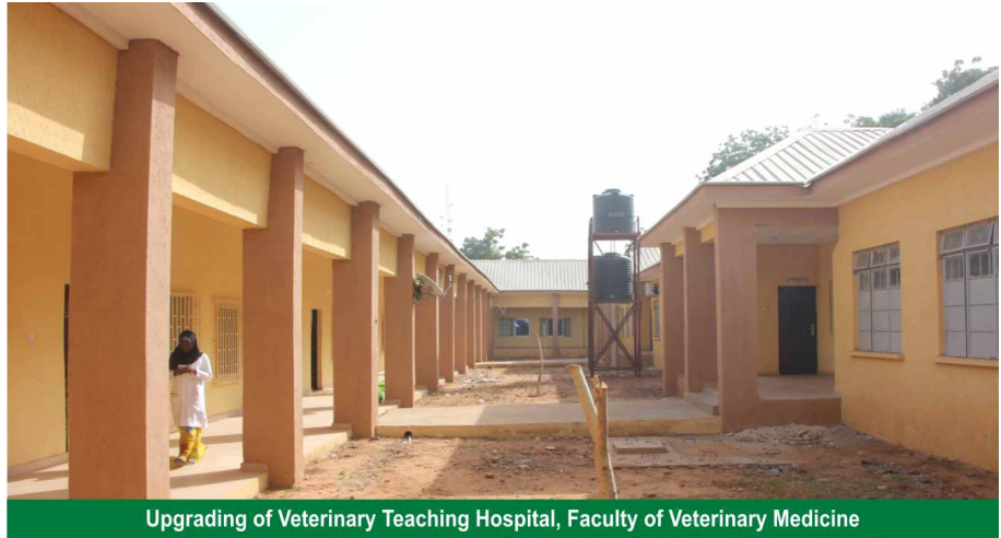
Upgrading of Veterinary Teaching Hospital, Faculty of Veterinary Medicine

Constructions and furnishings of administrative block for the department of Geology at the cost of N269.8 million; ICT complex at N470