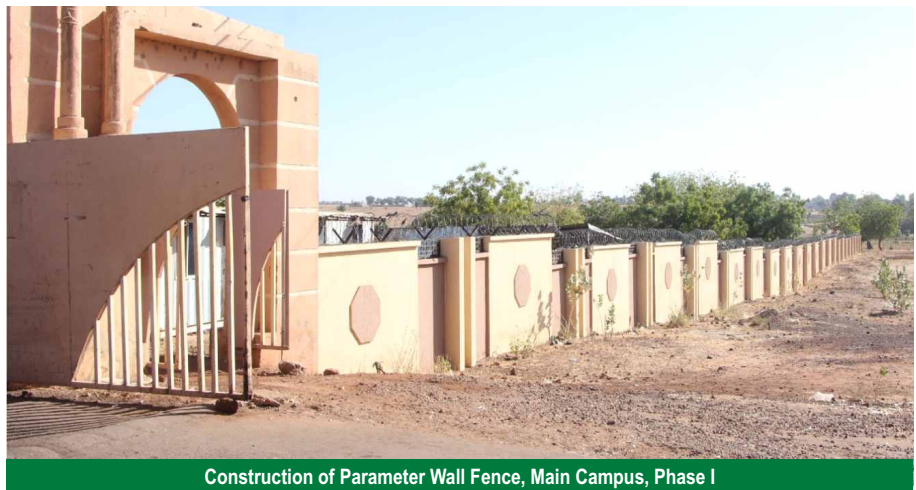
Construction of Parameter Wall Fence, Main Campus, Phase I