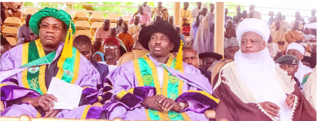
From Left: Representative of President Bola Ahmed Tinubu, Honourable Minister of Education, Prof. Tahir Mamman; Sokoto State Governor, His Excellency, Ahmad Aliyu Sokoto; and Sultan of Sokoto, His Eminence, Muhammad Sa'ad Abubakar III, CFR;