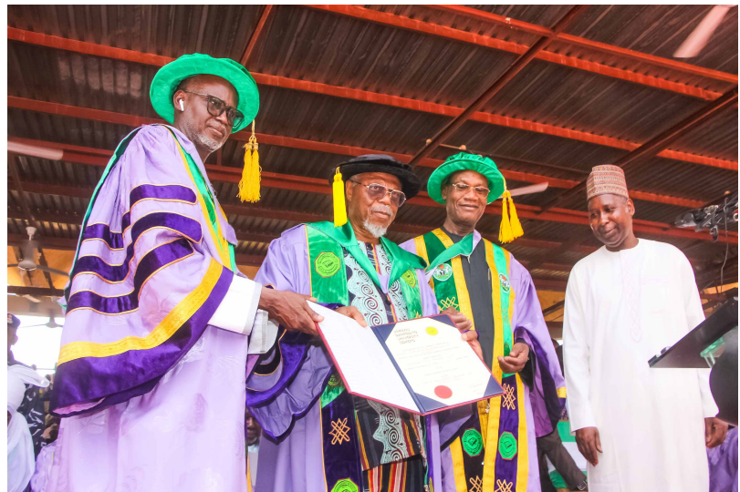
Professor Toyin Falola (2nd from left), being presented with Doctor of Letters (D.Litts) honorary degree