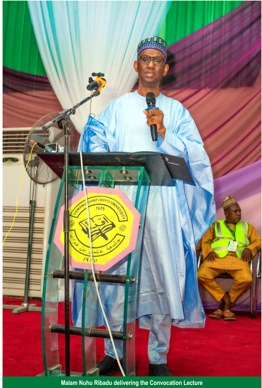
Malam Nuhu Ribadu delivering the Convocation Lecture

He also highlighted some of the contributions of the University towards attaining peace and development in the region and Nigeria at large