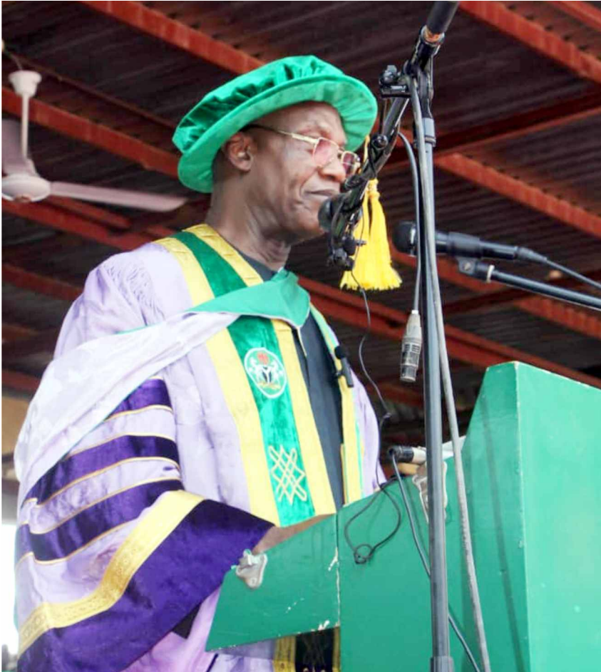
Honourable Minister of Education, Professor Tahir Mamman, delivering President Bola Ahmed Tinubu's convocation address

President Bola Ahmed Tinubu has congratulated three lecturers of Usmanu Danfodiyo University who recently won awards over their groundbreaking researches.