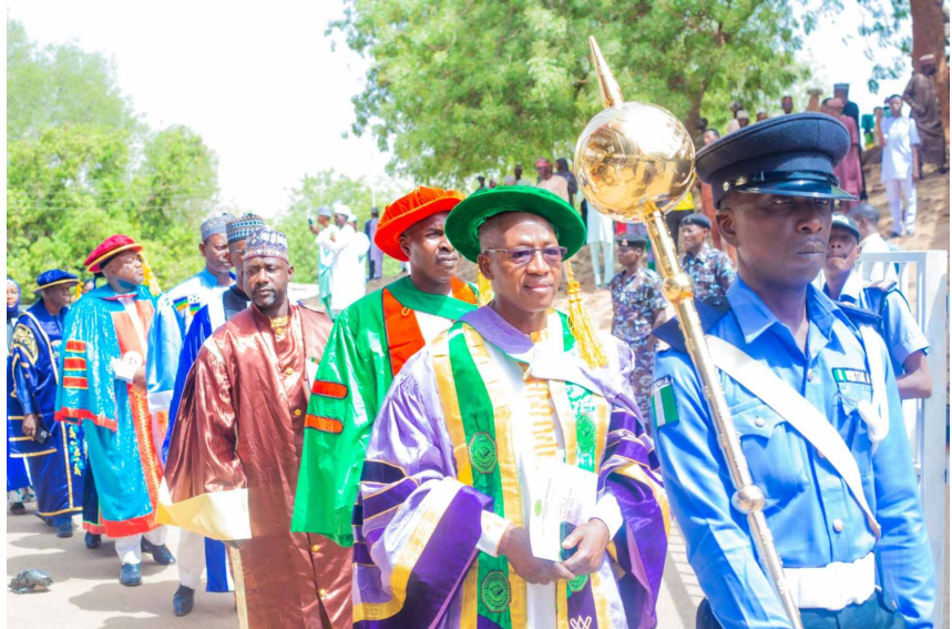
The University Mace Bearer leading the convocation procession