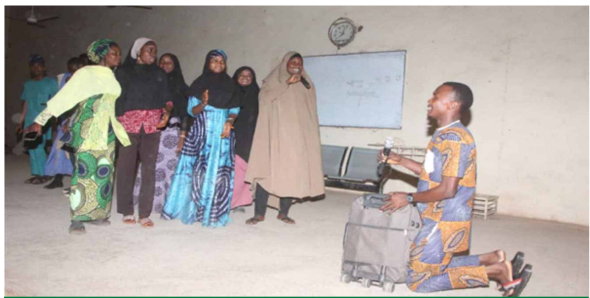
A play in session