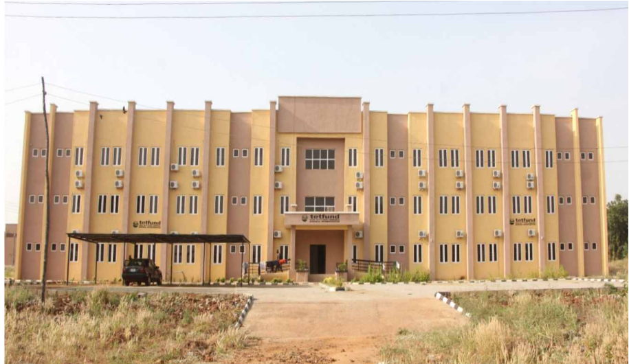
Construction of Faculty of Allied Health Sciences Phase I