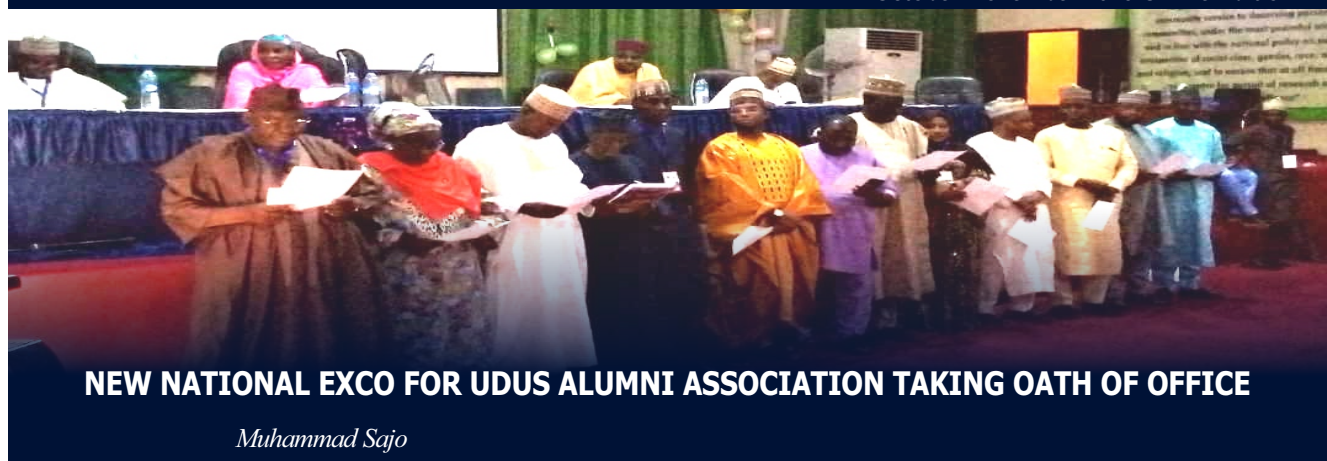
NEW NATIONAL EXCO FOR UDUS ALUMNI ASSOCIATION TAKING OATH OF OFFICE