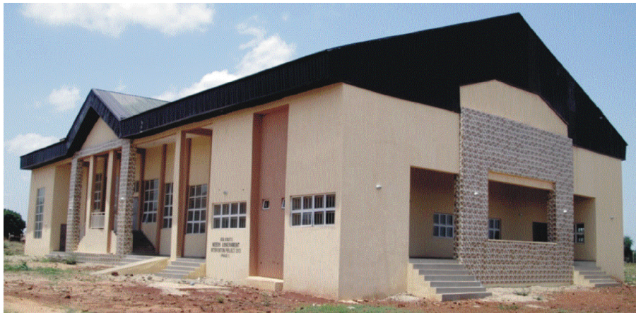
Plate IV: : Multipurpose Lecture Hall, Main Campus