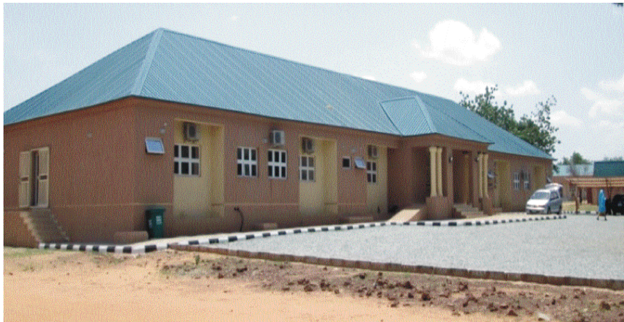
Plate XI: Registry Department