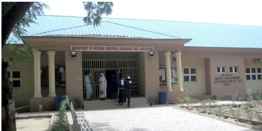
Plate V: Department of Modern European Languages & Linguistics