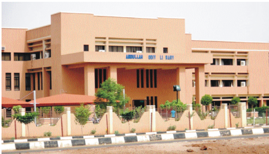
Plate XII: Main Library ( Abdullahi Fodiyo Library )