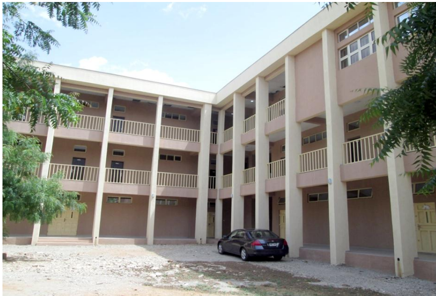
Plate VI: Faculty of Engineering & Environmental Design