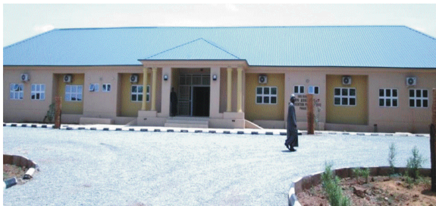
Plate X: Bursary Department