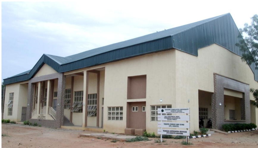
Plate IX: 500-Seat Lecture Hall at the College of Health Sciences