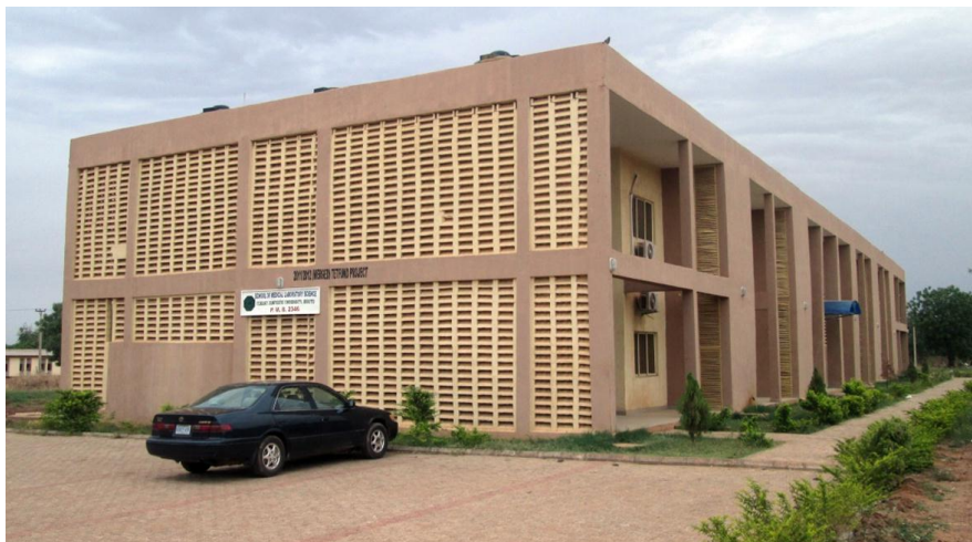
Plate VII: Faculty of Medical Laboratory Sciences Administrative Building