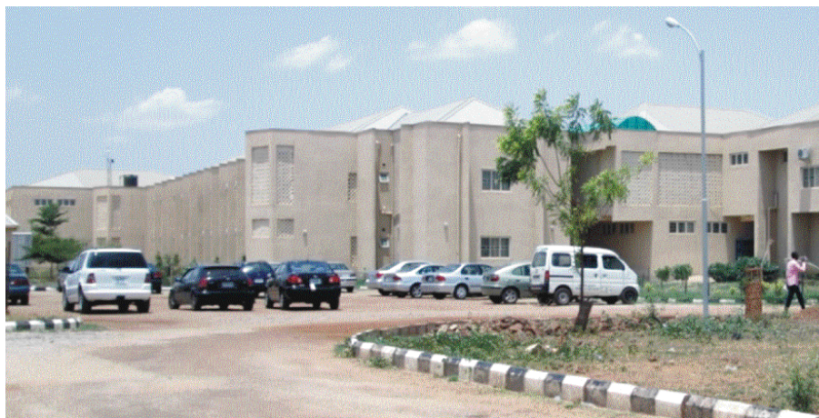
Plate III: Faculty of Social Sciences