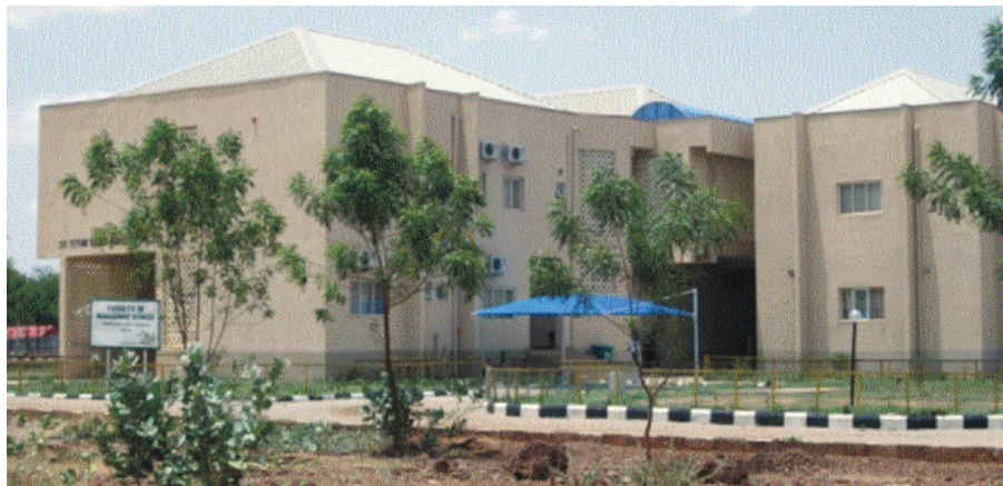
Plate II: Faculty of Management Sciences