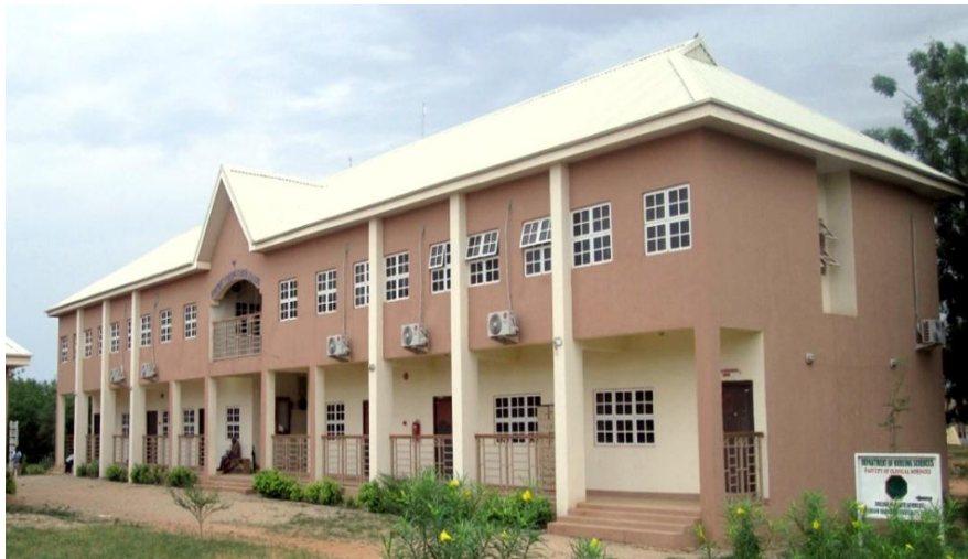
Plate VIII: Department of Nursing Sciences