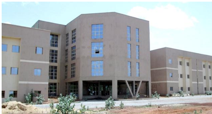
Plate I: Faculty of Veterinary Medicine:

The Academic Year consists of two semesters of 17 weeks each.