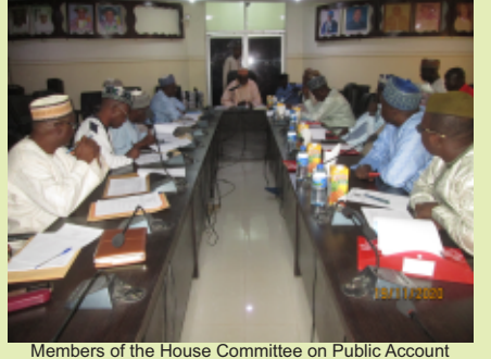
at UDUS Senate Chambe

projects executed by the University among which were the new Faculty of Engineering which is a TETFund 2015/2016 intervention Project. The Committee expressed their satisfaction on the inspected projects.