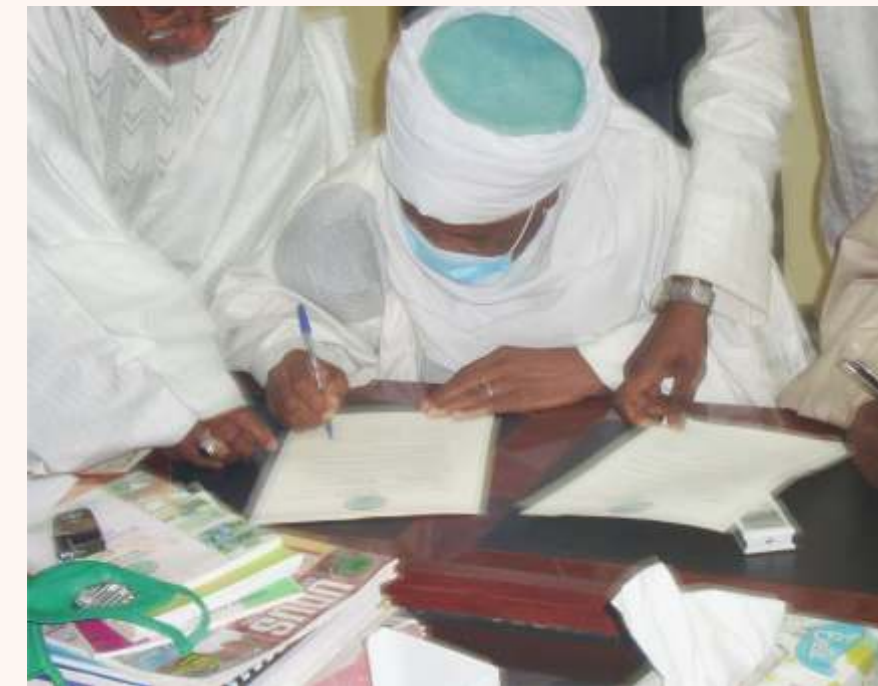
Signing of MoU on University Perimeter Wall