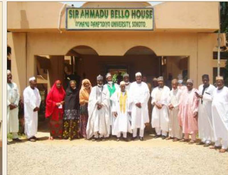
Members of former President Shehu Shagari family and University management staff when the former paid courtesy call to the University