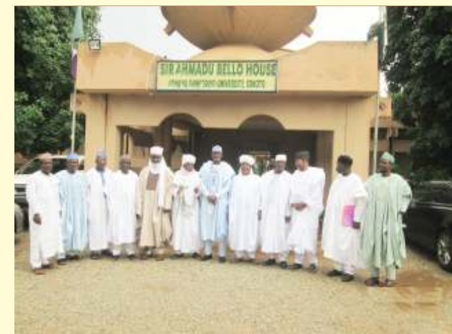
Traditional rulers within the University community posed for a snap after a function in the campus