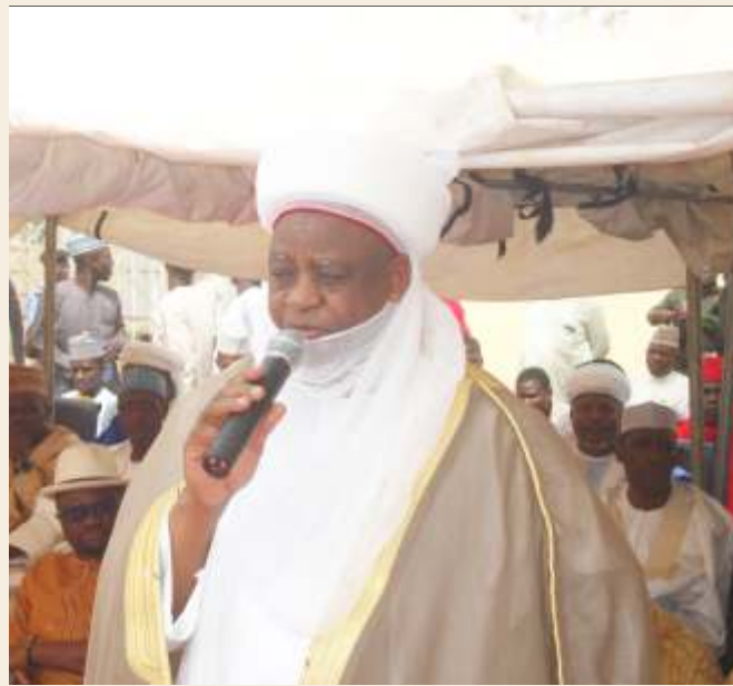
Sultan Muhammad Sa`ad Abubakar during the foundation laying ceremony of new girls hostel in UDUS