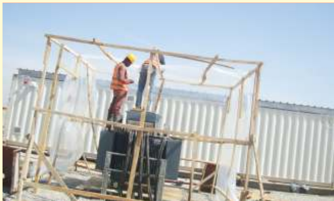
Technicians at work at Solar village, UDUS