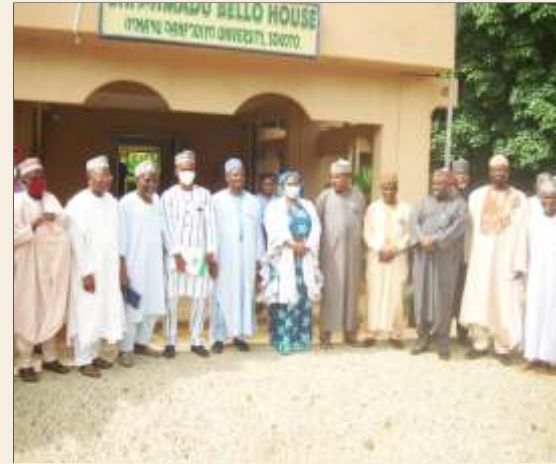
Members of Veterinary Medical Association of Nigeria when they paid courtesy call to UDUS