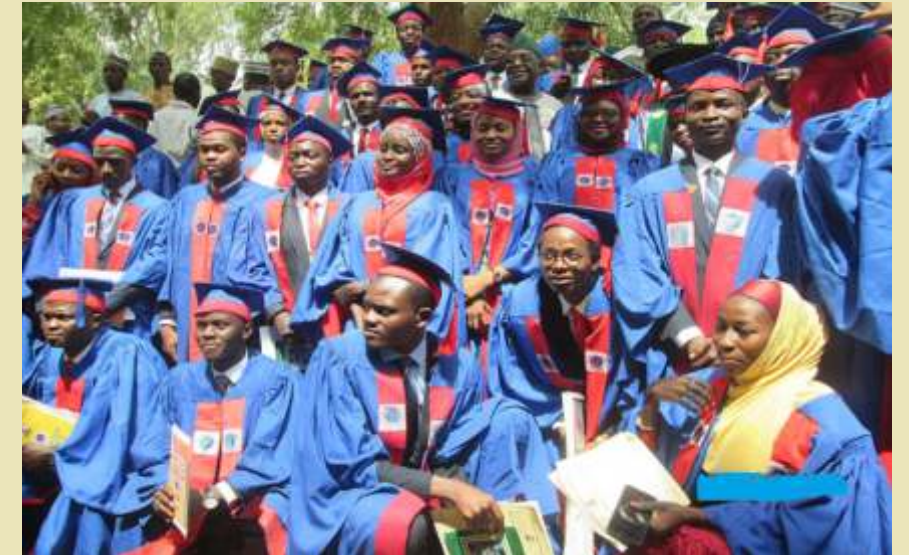
Cross section of students

According to him, "Seventy percent of medical decisions are made with Laboratory data and all efforts are needed to ensure that