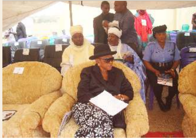
Chairperson Governing Council of UDUS (Rtd) Justice Pearl Ejenere during a ceremony in UDUS