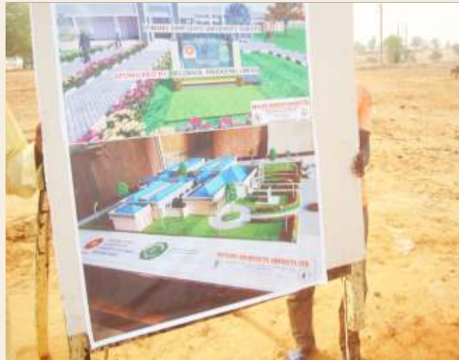
Prototype of new girls hostel under construction